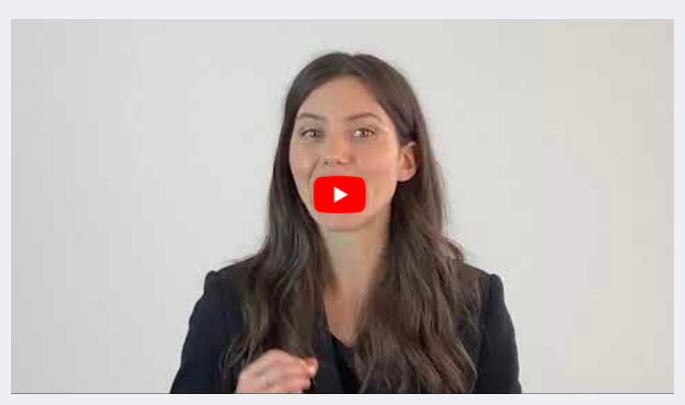
Click image for link to video.

If you are thinking about seeking help for a substance abuse problem, call us at 866.262.0531 to learn more about how you can improve your life today. Even if you have not yet accepted that you have a problem with substance abuse, seeking out help to find out what you can be doing to overcome your addiction is an excellent start. It is not easy to accept that you may have a problem with abusing drugs or alcohol. The first step is understanding that your life can improve and that there are people who can help you achieve the life that you want.